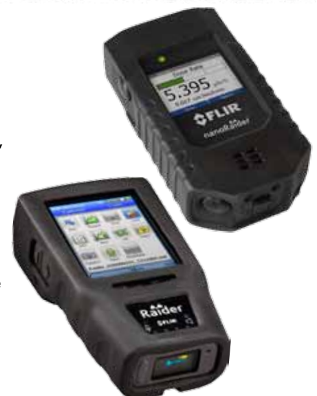
Raider Product Line

This rugged and small instrument provides identification capability usually associated with much larger devices. Its advanced detector technology provides a high quality measurement while users can easily operate the instrument through its two button interface based upon the common FLIR (identiFINDER® based) platform. Due to its small size and economical cost, a nanoRaider® can be deployed in place of existing PRD technologies with the added capability of identifying the isotope present. These features make it an ideal choice for those on the front lines of homeland security such as emergency responders and border patrol agents.