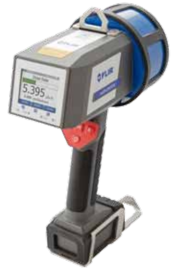
radHUNTER® Product Line

Using the same operating interface and advanced algorithms as the identiFINDER® provides our customers immediate comfort and confidence when using the device. The large size of the radHUNTER® prevents it from being ideal for general surveying, but its increased ability to detect and locate sources in difficult environments makes it appealing for a variety of challenging applications. The crystal design minimizes background interference and increases its ability to identify, even in complex monitoring scenarios. If large areas need to be scanned rapidly or there is potential for shielding of sources (as frequently encountered in truck and cargo scanning), the radHUNTER® provides vastly superior performance when compared to smaller devices.