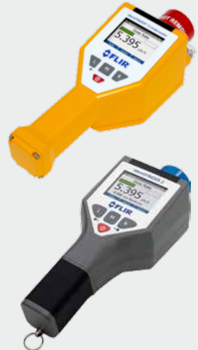
identiFINDER® Product Line

The identiFINDER® 2 is used in many applications today by police, fire, border patrol, and various other agencies. The advanced algorithms allow any user to take highly sophisticated scientific measurements even when operated by a non-technical user. The performance and size of the instrument make it appealing for general surveying. Whether the application is scanning people, bags, vehicles, etc... the identiFINDER® will rapidly detect and identify the source of gamma radiation. With a variety of models to choose from, the identiFINDER® is a perfect choice for a variety of scenarios.